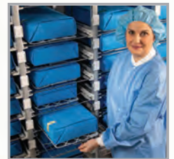
UBeFlex® Storage System