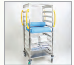
Open Stericart: Trays & Sterile Supplies