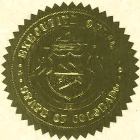
Jared Polis Governor

A handwritten signature in black ink that reads "Jared Polis".